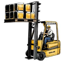
15. PACKAGING AND STORAGE