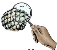
02. INSPECTION, ANALYSIS Y AGAVE STORAGE