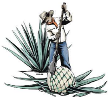
01. "JIMA" AGAVE TRIMMING